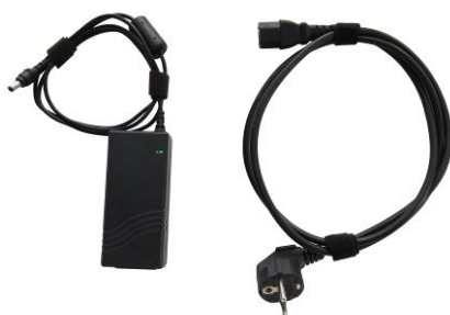
Power supply adapter