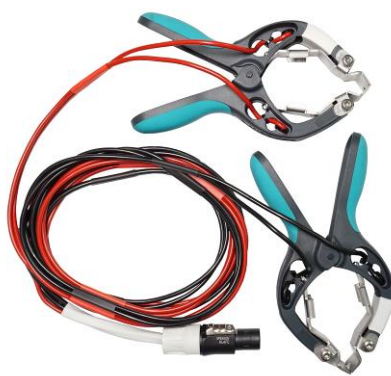
X winding current and sense cables with TTA clamps