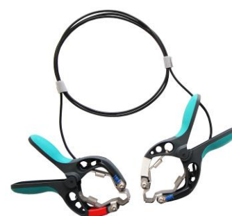
Jumper cable with TTA clamps