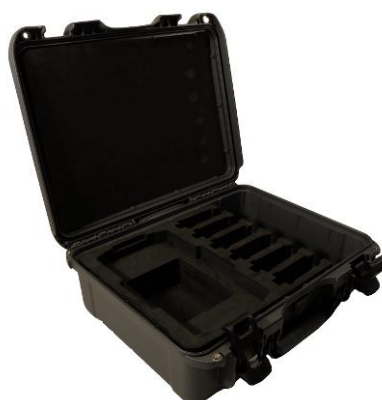
Plastic transport case