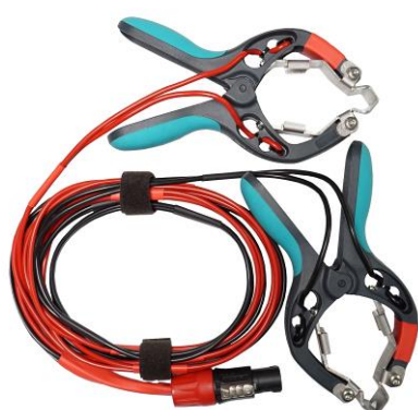
H winding current and sense cables with TTA clamps

All specifications herein are valid at ambient temperature of +25 °C / +77 °F and recommended accessories. Specifications are subject to change without notice.